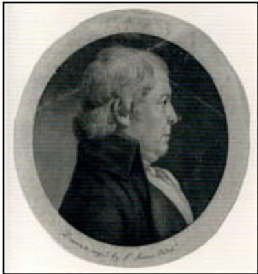
Paul Revere portrait & letter

Presented by: the Paul Revere House & the Massachusetts Historical Society