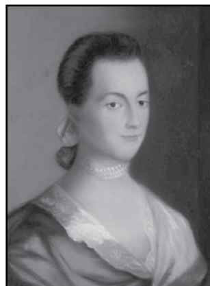
Abigail Adams

Massachusetts Historical Society 1154 Boylston Street, Boston, MA 02215